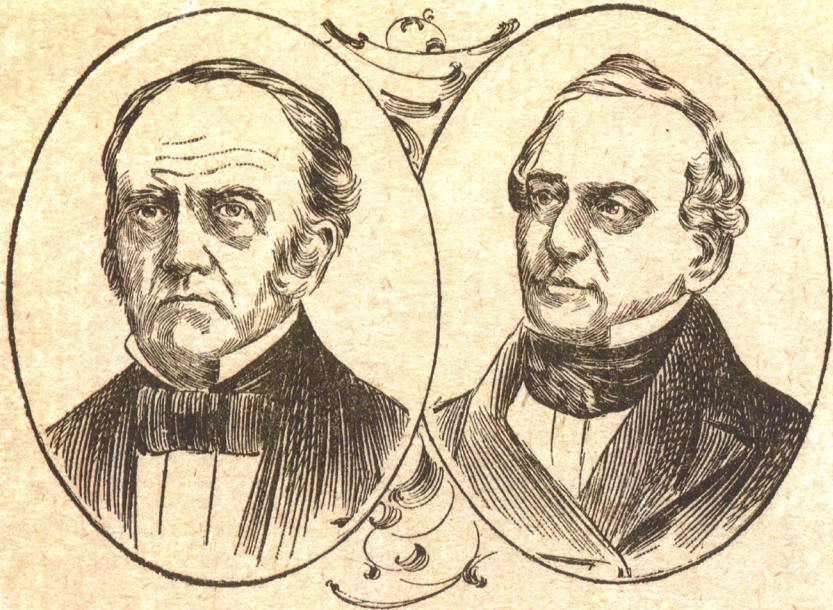
BELL AND EVERETT. Union Candidates for President and Vice President.